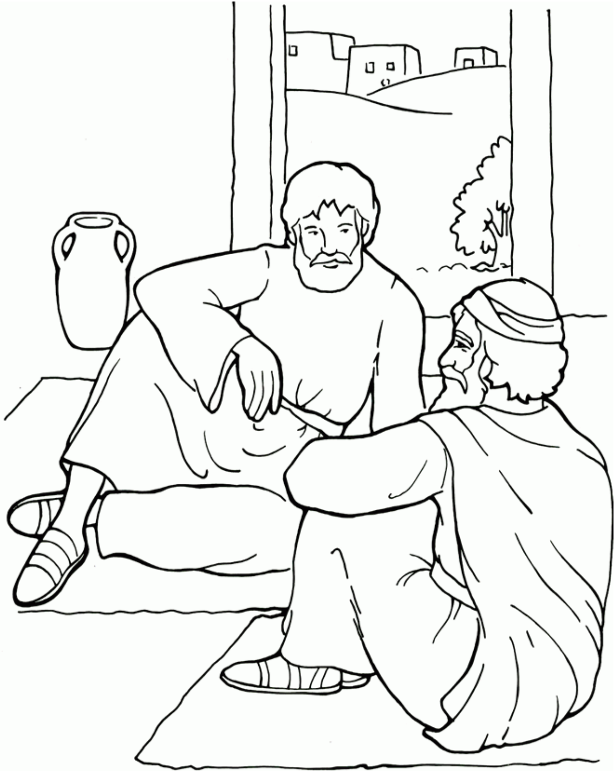
Paul talks with an elder in Jerusalem before the council.