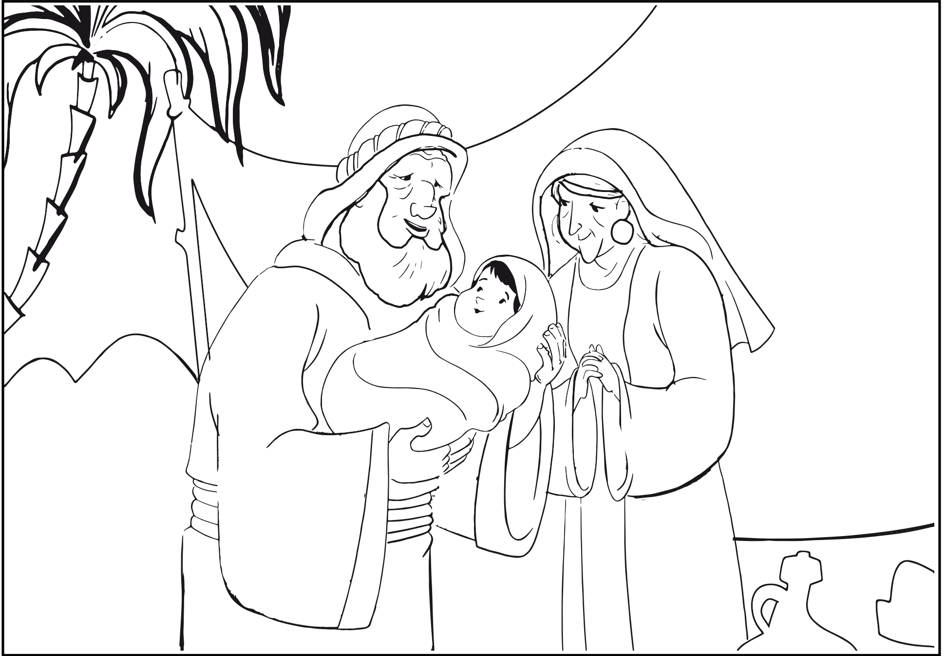
Abraham had a son.